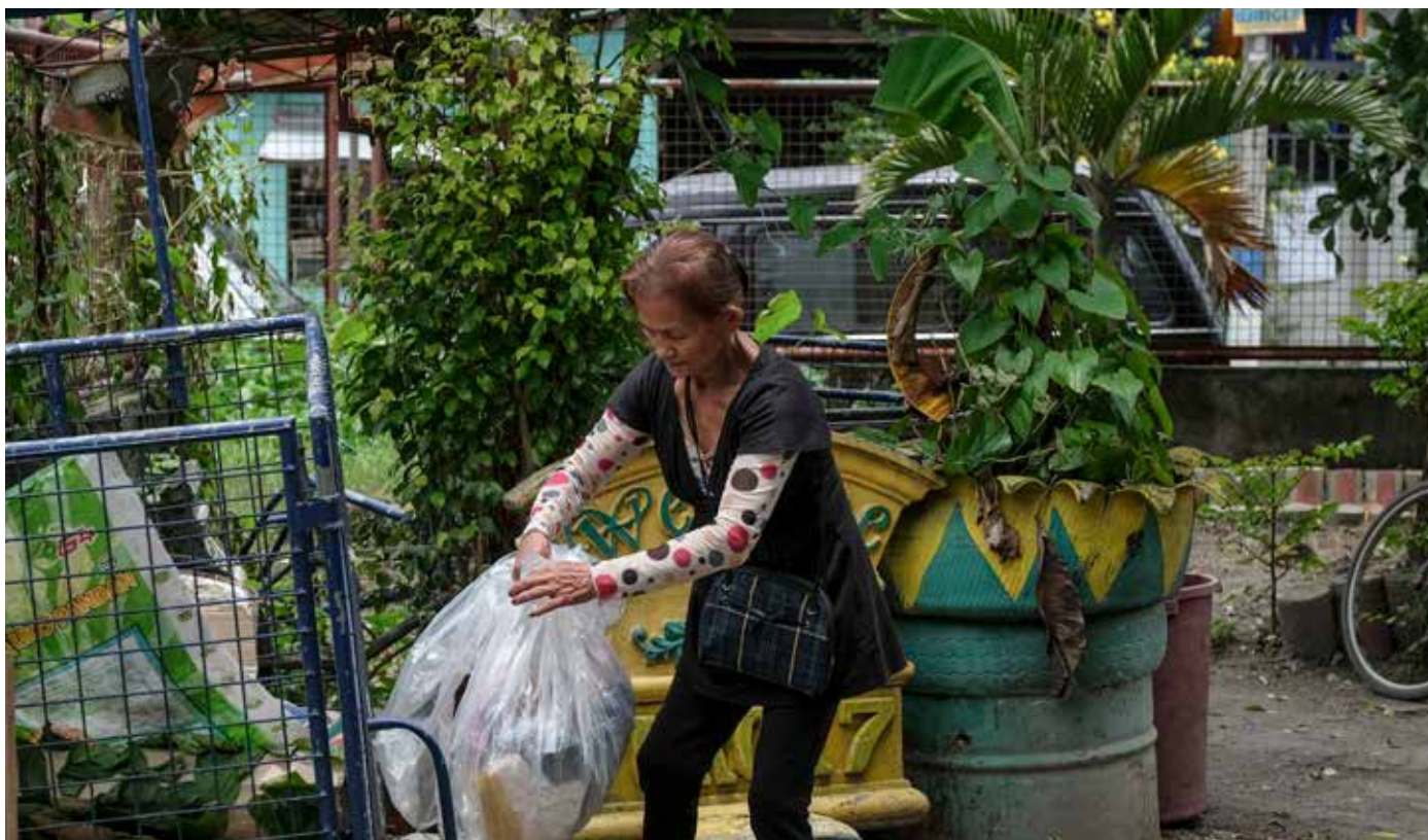
A waste worker in San Isidro works at the barangay materials recovery facility.