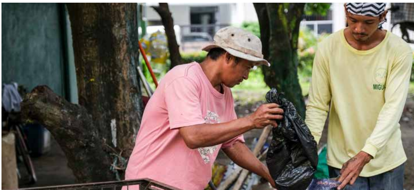
Waste workers in Pilar Village collect waste from the households.

When the new administration led by city Mayor Edwin Santiago took over in 2013, the city's waste management program was not only sustained but also saw great improvements. While former Mayor Oscar Rodriguez focused on model-building of barangays, Mayor Edwin Santiago directed his efforts towards scaling up and institutionalizing the program by expanding it to all barangays, including schools and subdivisions. It was also during Mayor Santiago's term that the Plastic Free Ordinance of 2014, authored by City Councilor Benedict Jasper Lagman, was enacted.