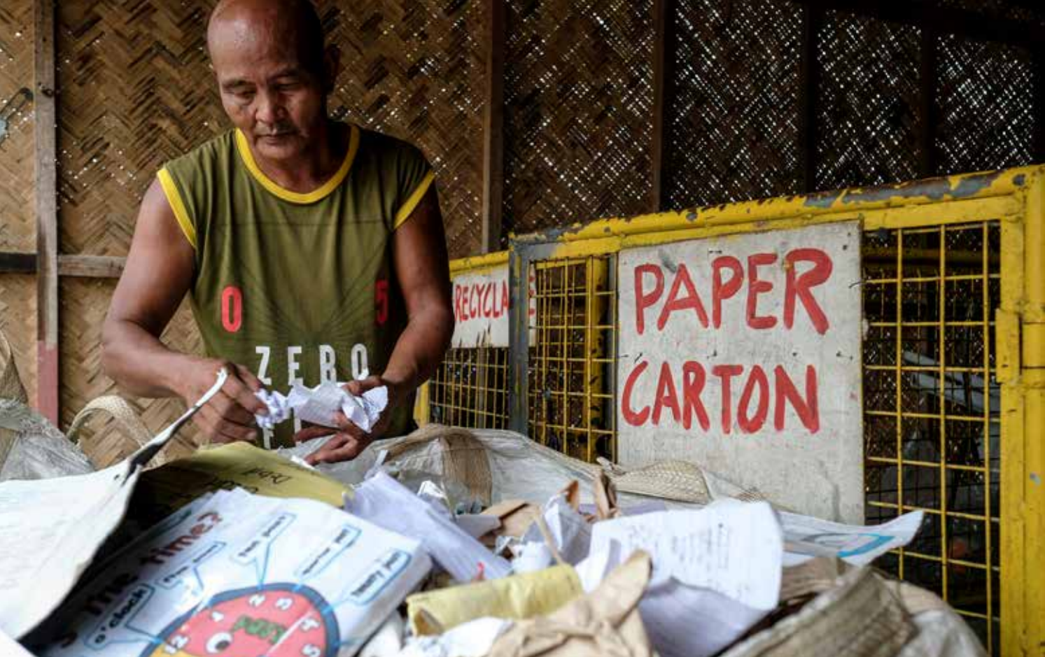
A waste worker in Barangay San Isidro further segregates recyclable paper.